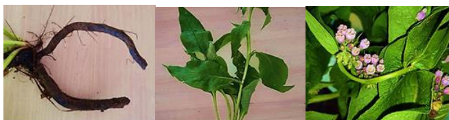
Figure 1. Symphytum officinale L.

Symphytum officinale L from the mountain Golija, Republic of Serbia, chemically untreated, was selected for investigation. Concentrations of five macroelements (Ca, Mg, K, Na, P), were determined by ICP-OES method, after samples mineralization. Macroelement concentrations were determined in all parts of the plant separately (leaf, flower, stem, root).