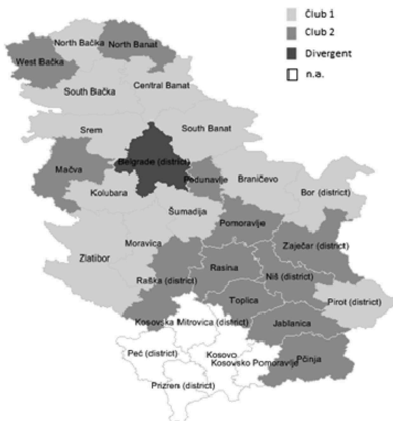
Figure 1. Convergence clubs.

south) has not changed or mitigated significantly in the transition period (after 2000). The advantage of the northern areas of Serbia lies in relatively higher per capita income and employment and in the created preconditions for development—built infrastructure, position on international corridors, and relatively more developed industry. In contrast, areas in southern Serbia are homogeneously underdeveloped over a wide area. With these types of