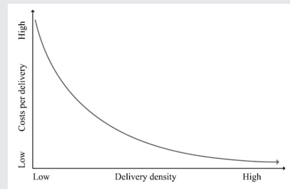
PICTURE 2. Goods home delivery costs

The time interval for the product delivery represents a frame which can be half an hour, an hour or several hours, within which delivery is performed. The retailers create time intervals offered to the buyers as well as different fees for the delivery during those time intervals. The costs of servicing the buyer in some of the time intervals can be significantly different varying from the interval. The reason is the usage limit of certain time intervals. Due to the same reason, it can sometimes be impossible to perform the delivery to a particular buyer. In order for the usage of time intervals to be successful, the retailers must make adequate