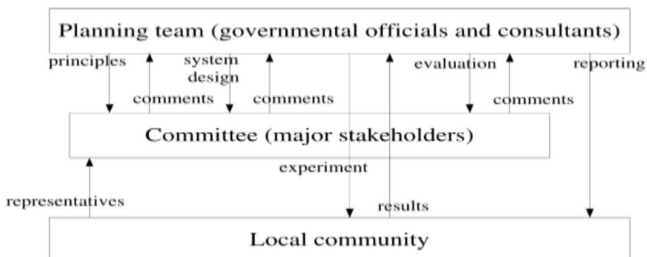
Chart 1 – Planning team with the participation of stakeholders

Urban freight actors are numerous. Public policy makers have to work jointly with a huge number of freight transportation companies, but also with a huge number of private partners and agencies interested in getting a part of the project activities. There is also a big number of private partners (companies, agencies) to whom, anyhow, some activities have to be outsourced, thus becoming more efficient and producing better economic results. That could be external agencies for data collection or maintenance of the intelligent system models. All of them could be involved in the public-private partnerships and working together.