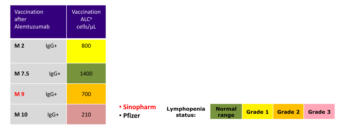
Fig. 2. SARS-CoV2 vaccine after initiation of Alemtuzumab treatment.